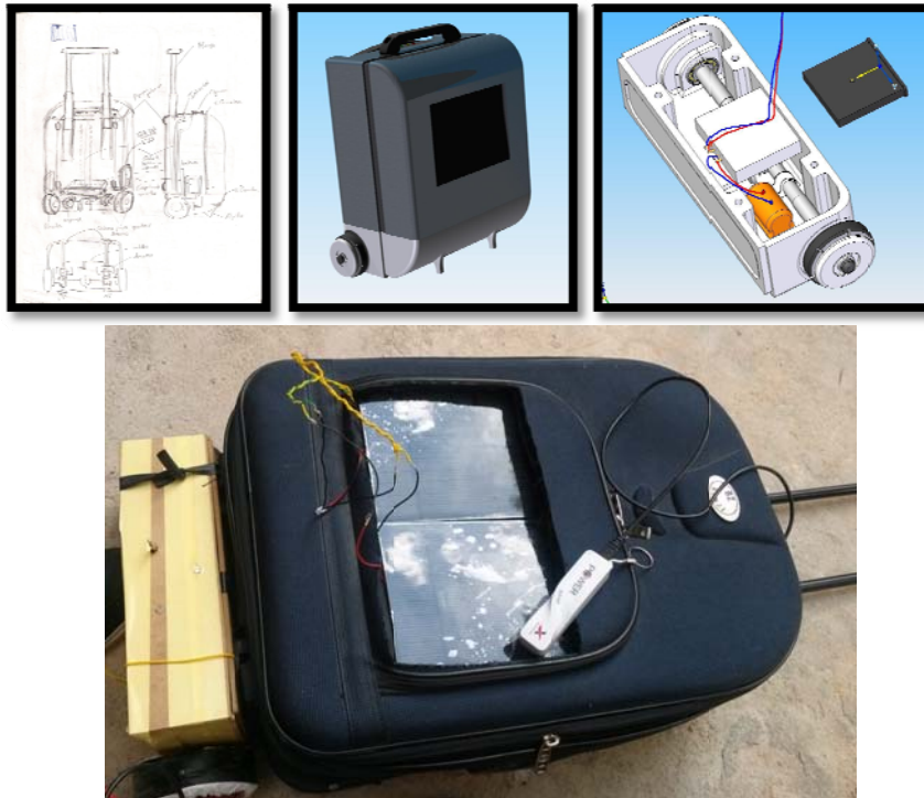
Figure 2. Example of a case study (linked to the complete development process of a self-powered trolley with connection to smart phone) as infrastructure for the subject.

During academic course 2014-2015, 22 students from the first promotion of our Master's Degree in Industrial Engineering (among a total of 180 engineering graduates) have taken part in the "Engineering Design" subjects of the INGENIA Initiative. At the beginning of the subject, the different students were divided into 5 groups and each group proposed at least 5 different machines or mechanical systems, which could potentially be developed within the subject. All the proposals were written down and a voting session was carried out, with participation of students and teachers, so as to decide the final devices to be developed in parallel to the subject. In the end, the 5 mechanical systems selected (one assigned to each group) were: